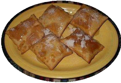
Authentic Sopapillas 6.25