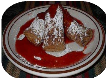
Chimi Cheesecake 6.95