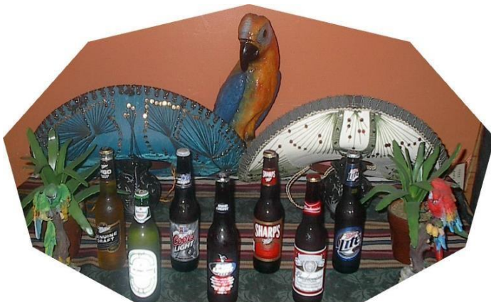
American Beer 4.50

Pina Colada, Strawberry Margarita, Strawberry Pina Colada 4.75