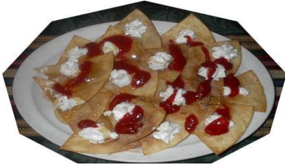
Sopapillas 4.95 Served with strawberry or chocolate