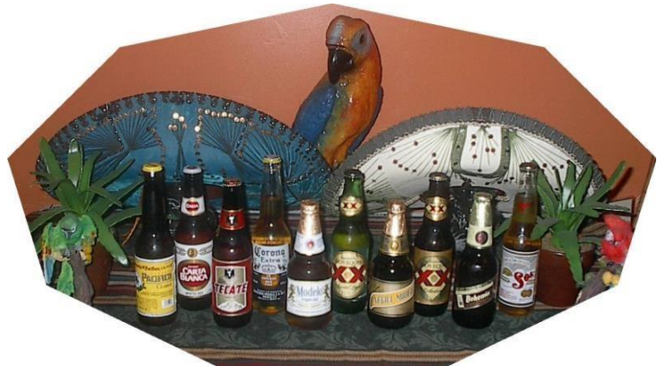
Mexican Beer 5.25

Budweiser, Bud Light, Coors, Coors Light, Michelob Ultra