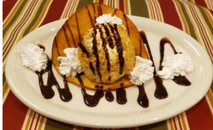
Fried Ice-Cream 5.95 Served with strawberry or chocolate.